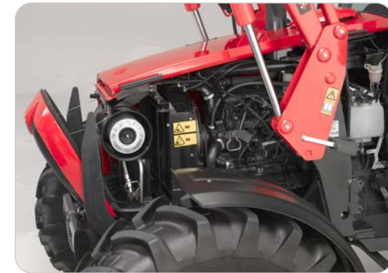
Access to engine service points and battery is good - even with a front loader fitted

With an independent oil reservoir and dual filters for the hydraulic system, oil contamination is minimised, reducing servicing costs.