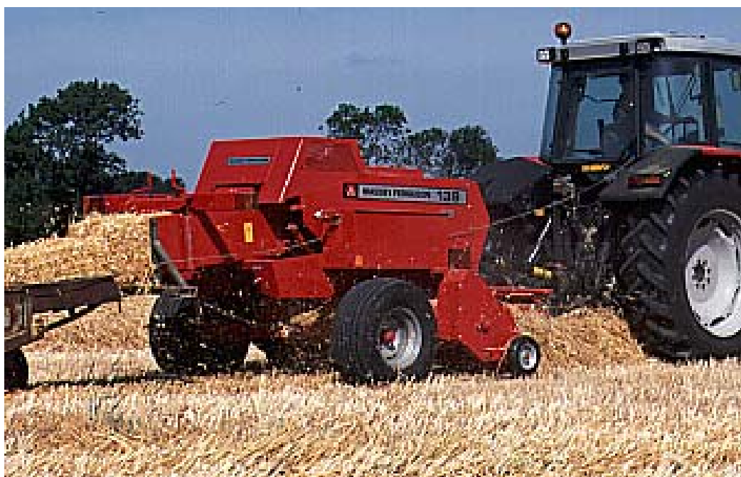
Left: MF 137/139, 2.0 m 'low profile' pickup